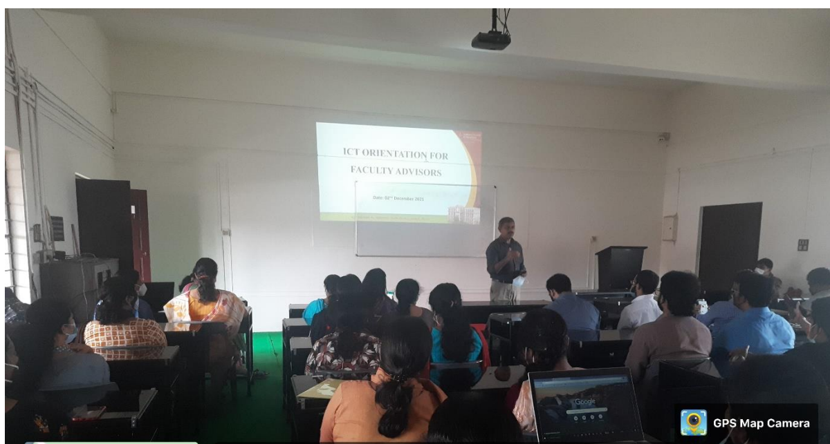
Training on "ICT Tools in Education"