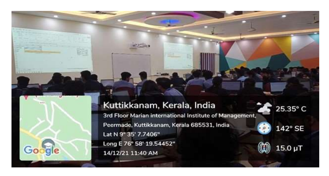
Flipped Class room session in Progress