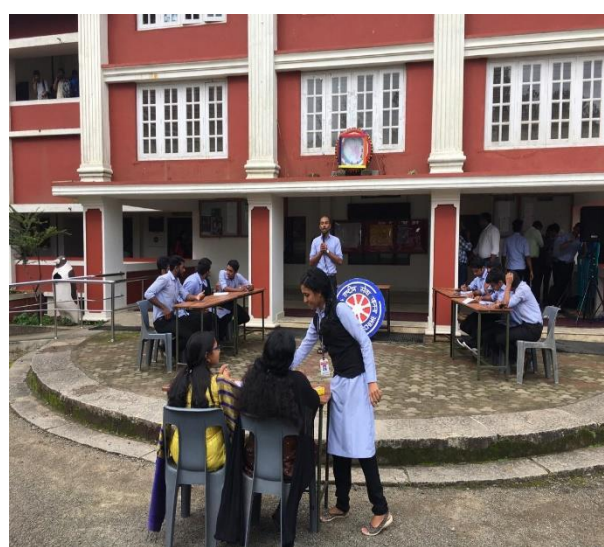
Open Air Auditorium near in front of the Academic Block