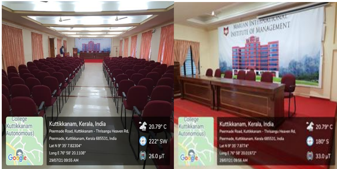
Conference Hall II

Conference Hall 2 is on the first floor of Marian Institute of Management. It has a seating capacity of 240 and is equipped with modern Audio Visual facilities.