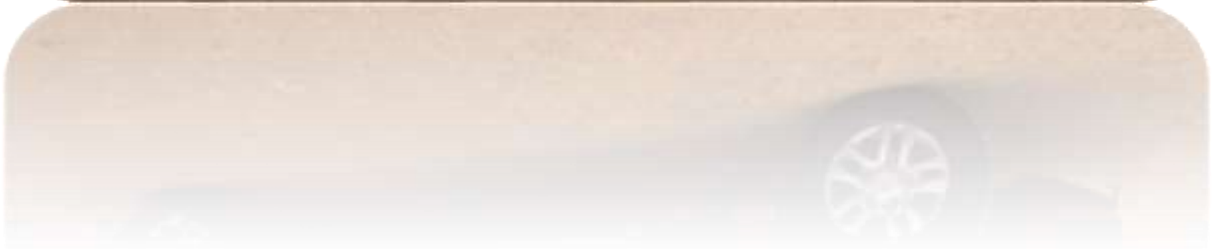
Fire and Safety vehicle exhibition conducted during fire and safety training program