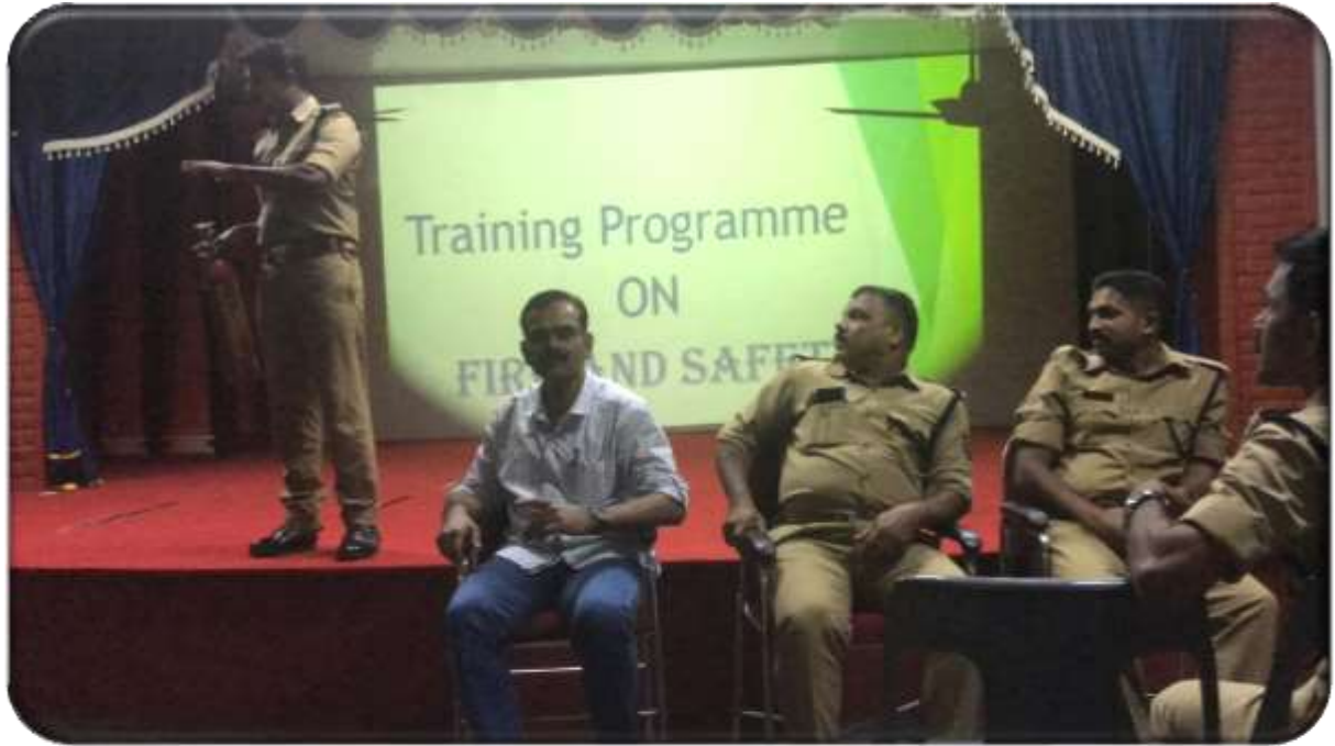
Training program on Fire and Safety conducted in the campus by the women cell in association with Fir and Rescue department on 13/04/2018