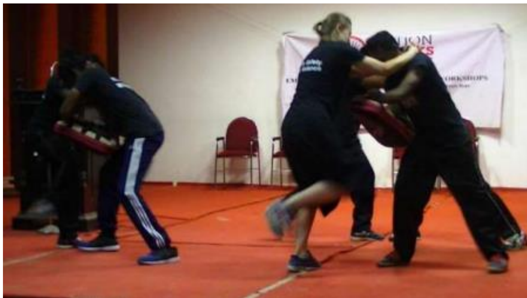
Sarah Palin and team demonstrating techniques of self defence