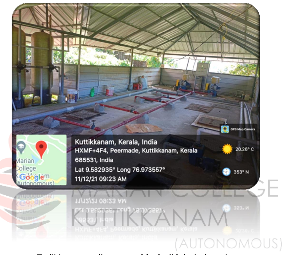
Facilities to trap oil, grease and food solids in the incoming water