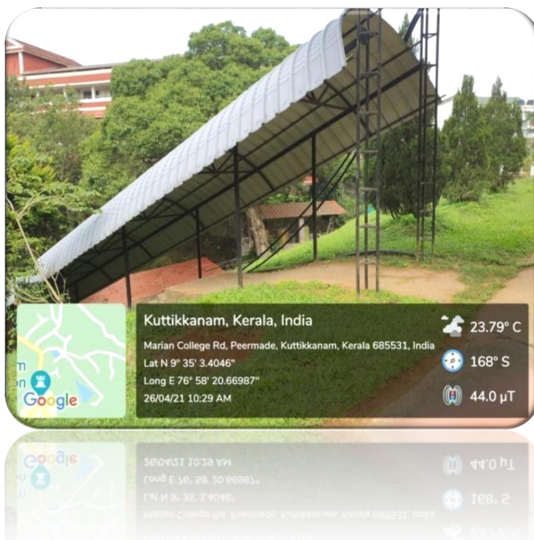
Pedestrian-friendly pathway connecting hostels and academic block

The pedestrian-friendly pathways with roofs are laid inside the campus in 2017. The aim of those pathways is to provide staff and students an experience comfort while walking in all seasons. The pathways are lighted using solar lamps and they are properly and periodically maintained.