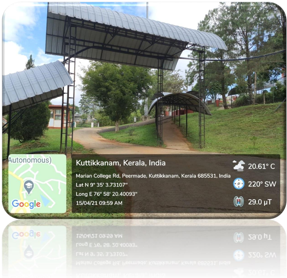
Pedestrian-friendly pathway near the hostels