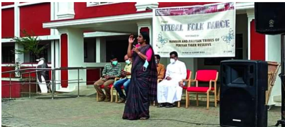
AZADI KA AMRIT MAHOTSAV Awareness Campaign.