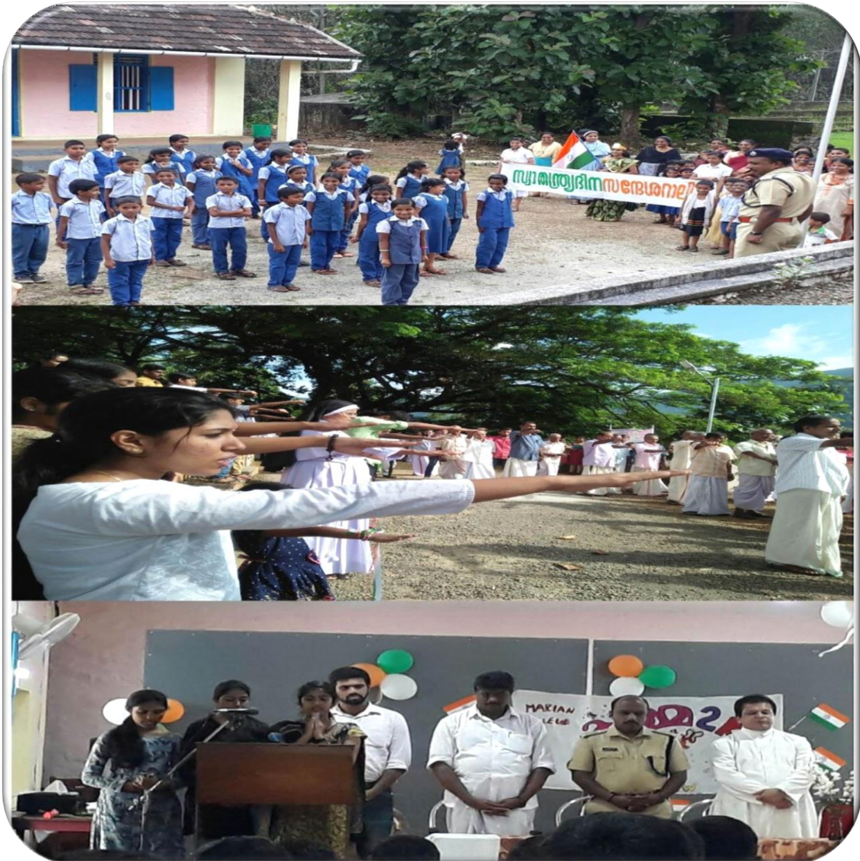
Independence Day celebration at the nearby school with participation across the society