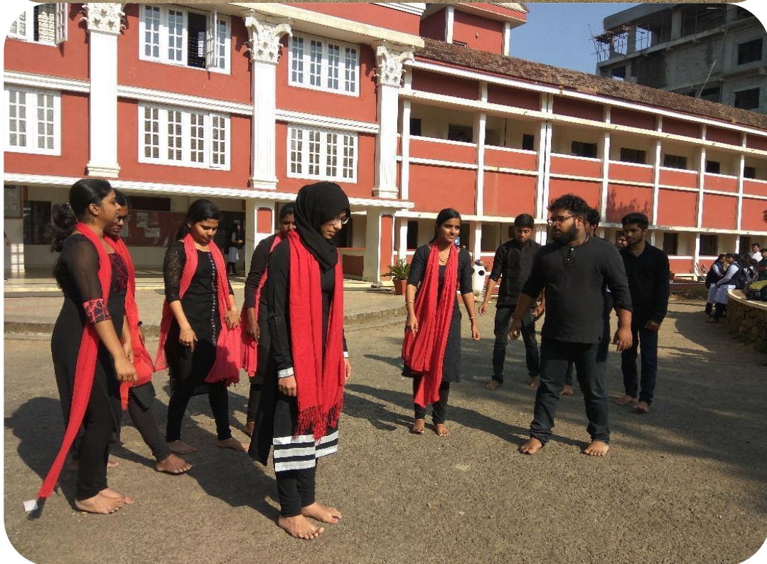
Women's Day: Street play competition (Themes based on Women's issues)