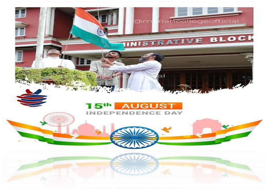
Flag hoisting ceremony

Marian College Kuttikkanam (Autonomous) celebrates Independence Day with great enthusiasm and patriotic fervour on 15th August every year. After the flag hoisting ceremony various programmes are conducted as part of the celebrations. Community service programmes ensure an inclusive environment as part of Independence Day programmes. Rallies, rural camps, support to construction of houses etc. are conducted as part of the programme.