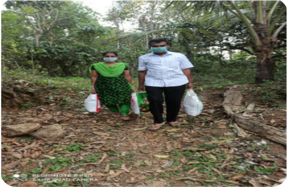
Distribution of food kits