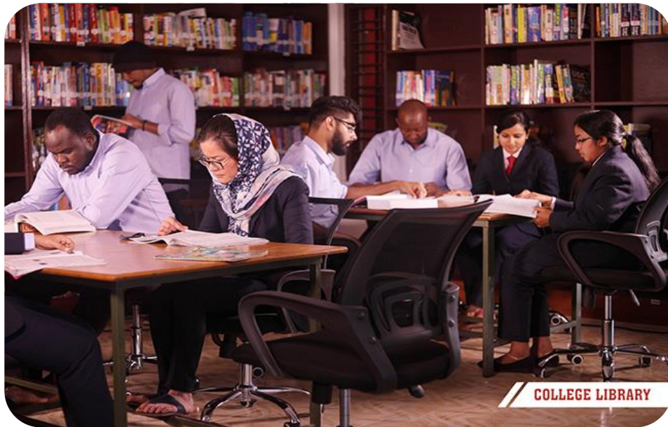
Foreign Students using Marian Library