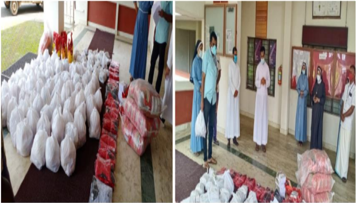
Distribution of Food Kits and Learning Materials during pandemic