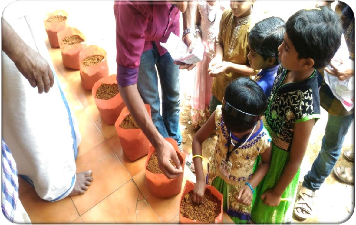
Seed Distribution at School