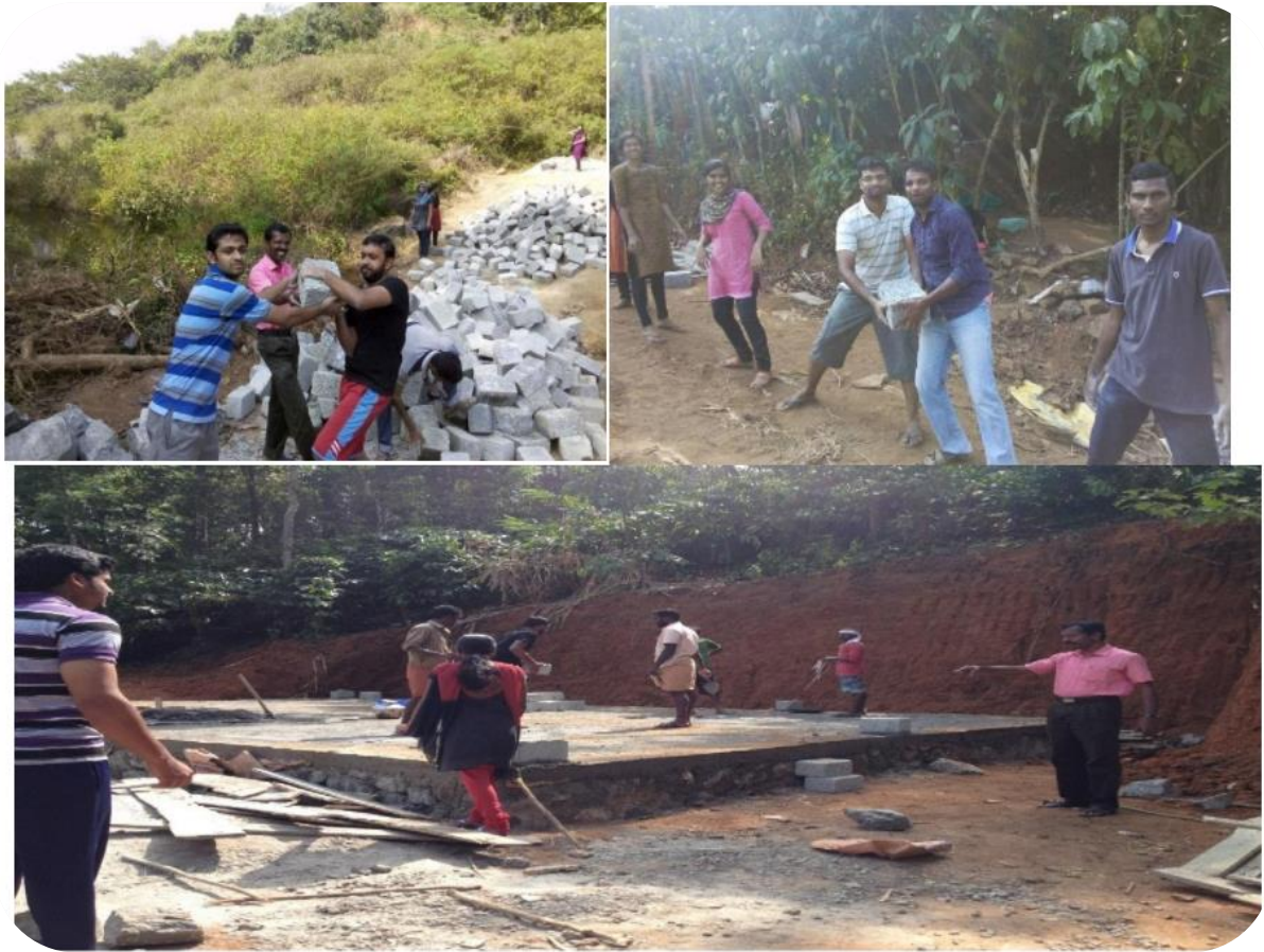
Helping in House construction