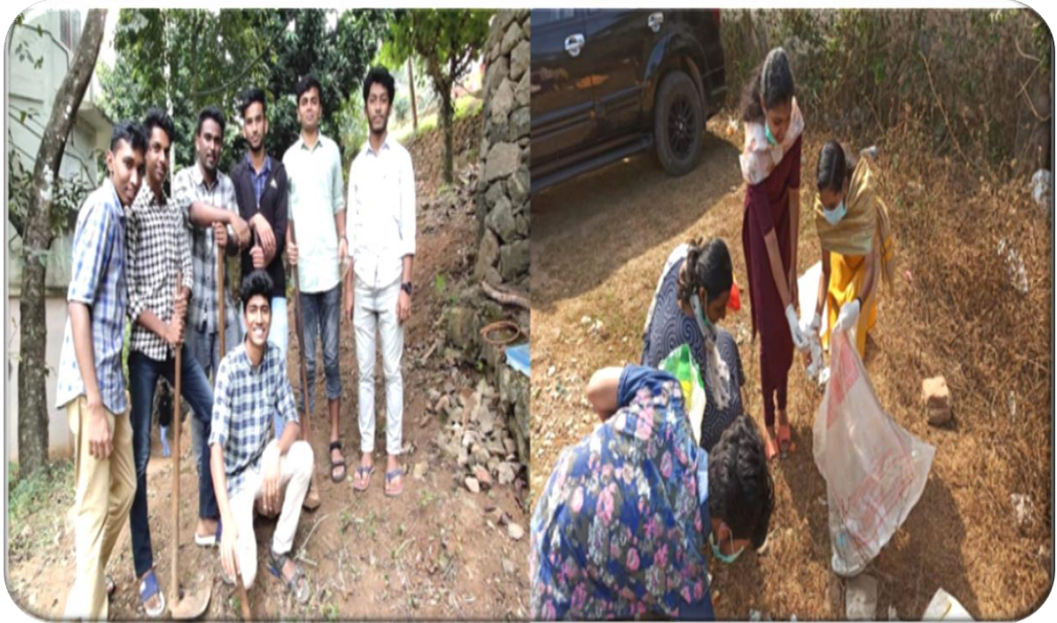
Cleaning at Vagamon, Idukki