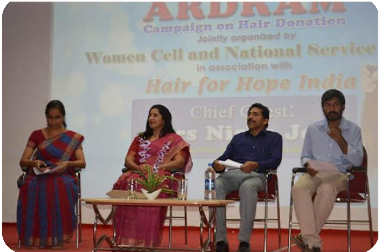
Hair donation campaign: Inaugural function