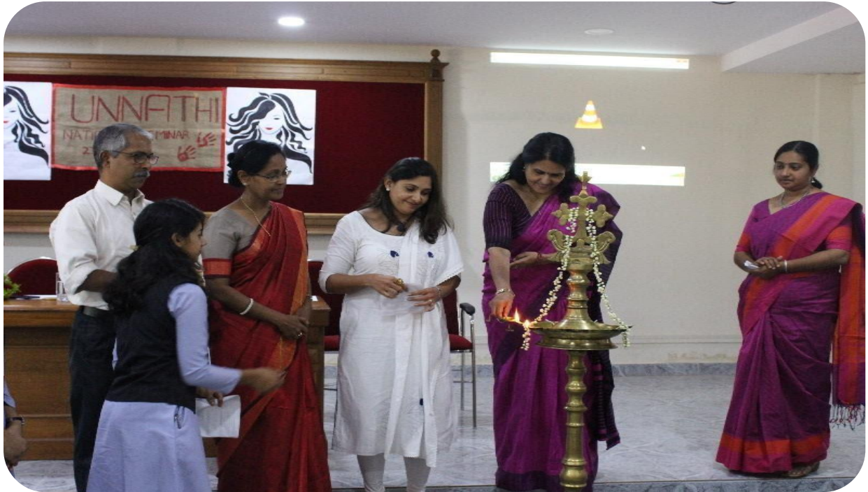
Women's Day Inauguration

International Women's Day (March 8) is a global celebration of the social, economic, cultural and political achievements of women. The day also marks a call to action for accelerating gender parity. Significant activity is witnessed in Marian College Kuttikkanam (Autonomous) as groups come together to celebrate women's achievements and rally for women's equality.