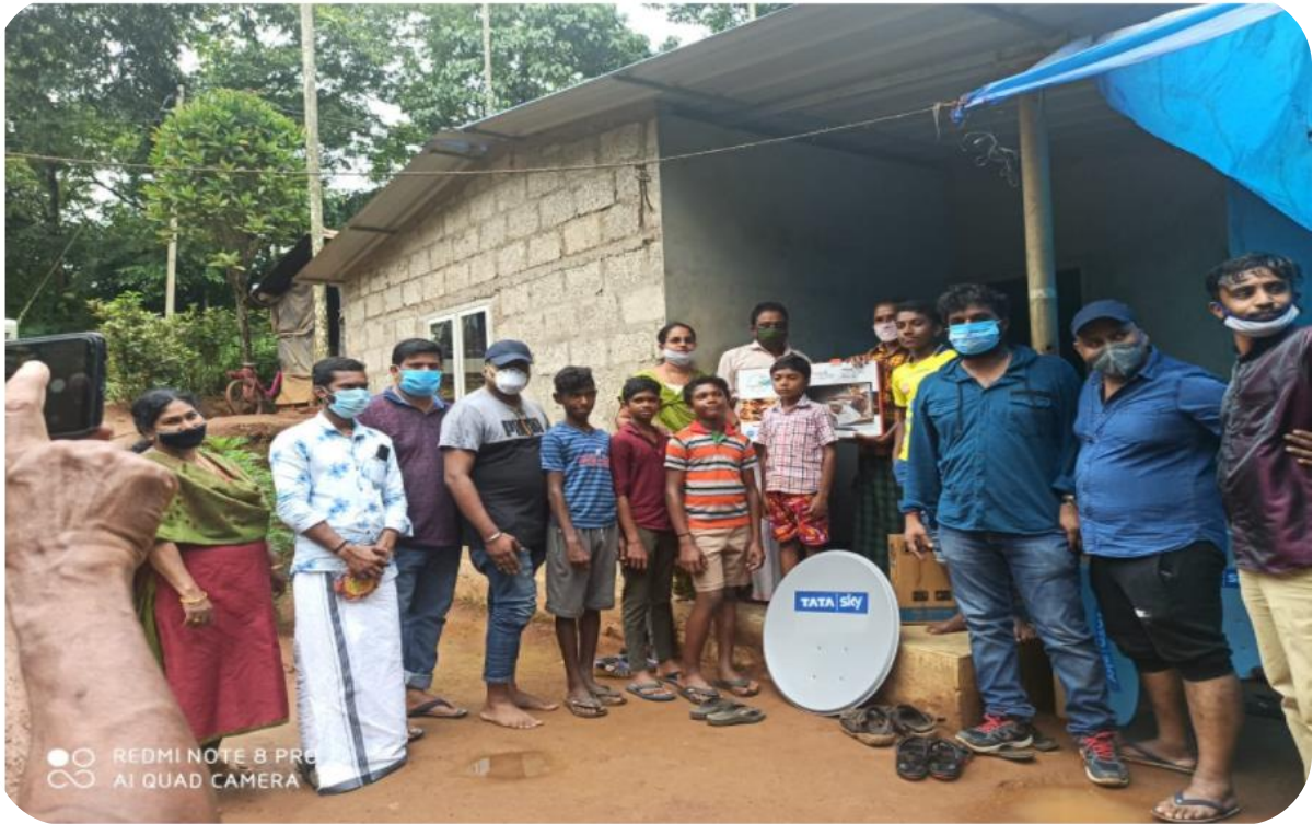
Distribution of Televisions for students for online education