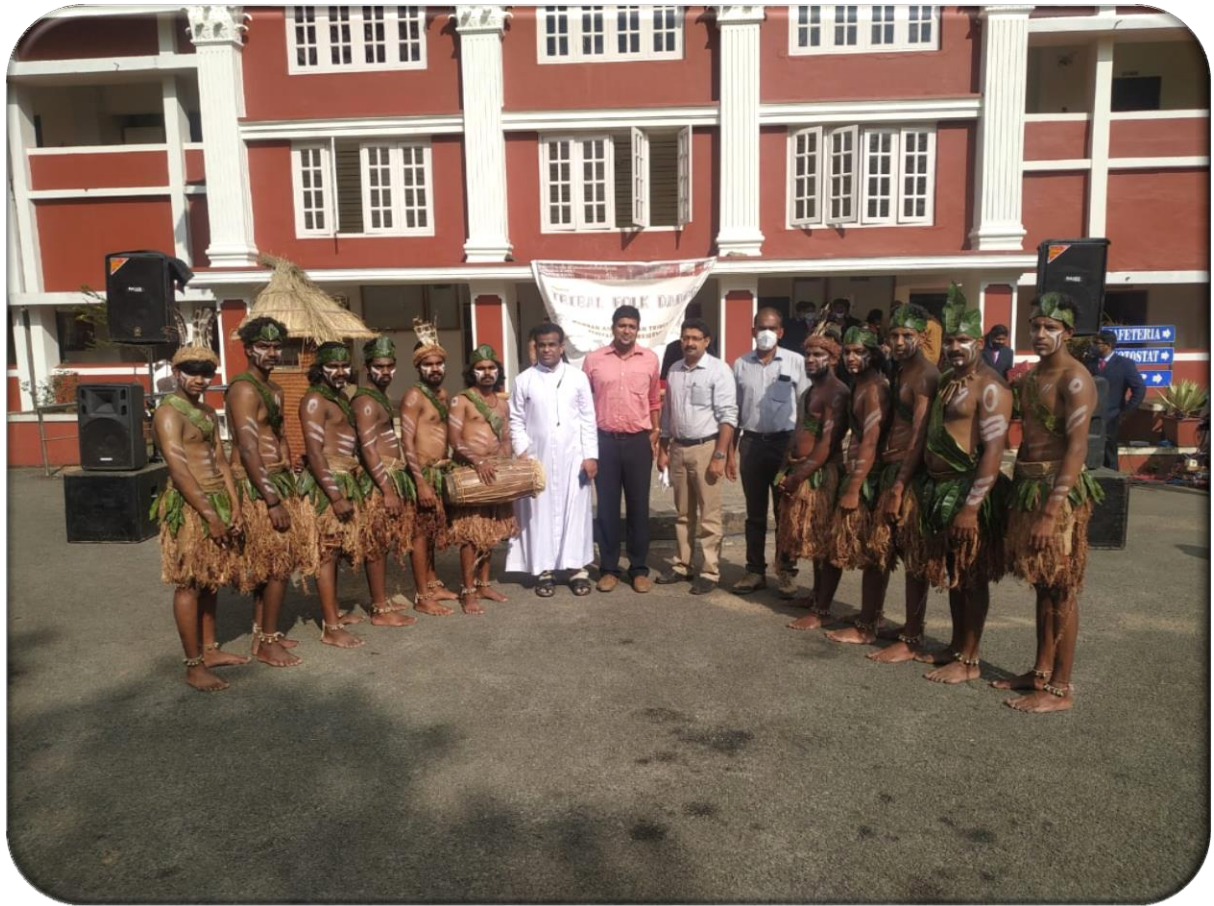
Interactions with Tribal Community - Showcasing traditional art forms in the campus