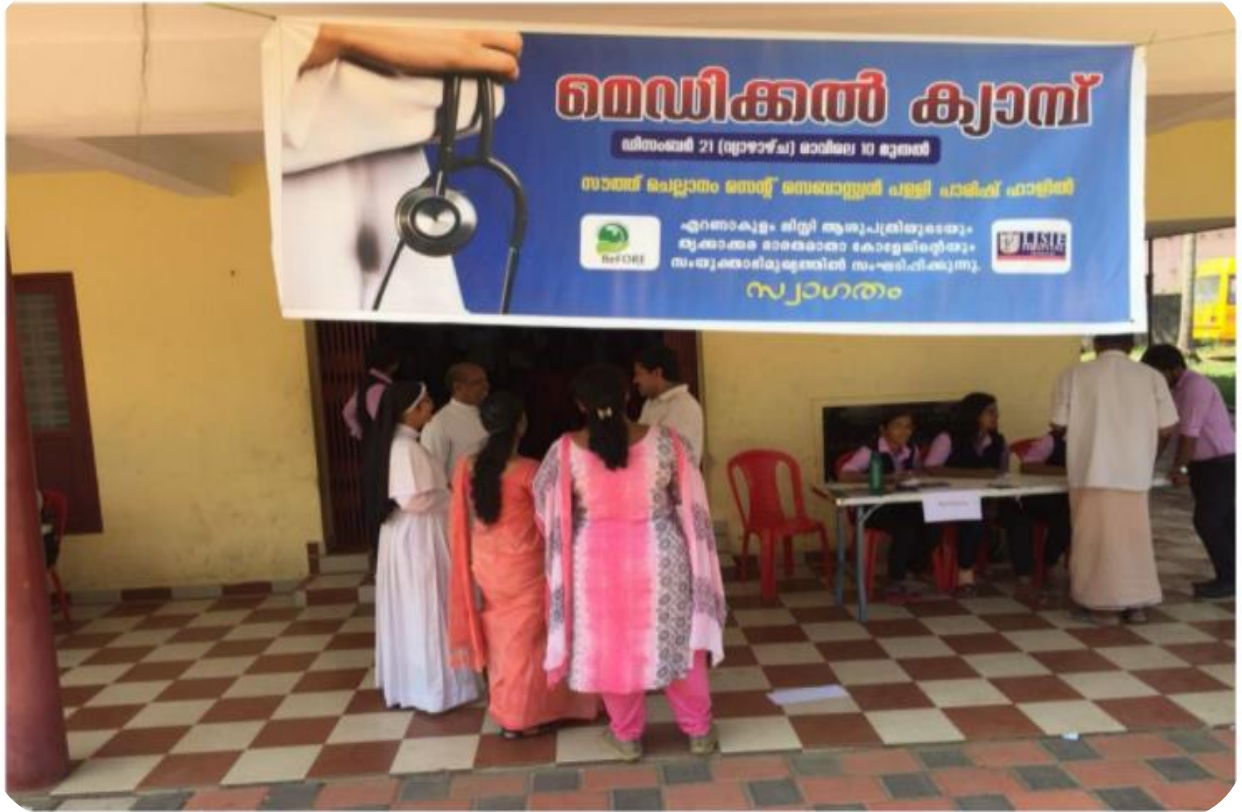
Entry of the Medical Camp