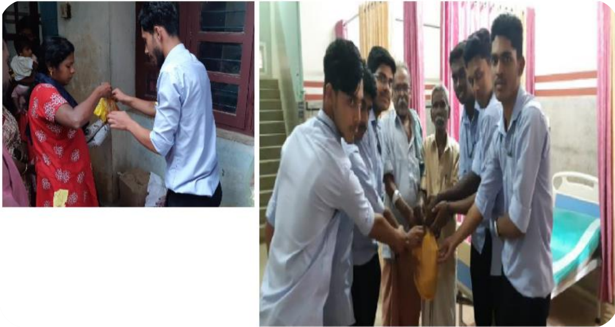
Students supplying lunch to the patients of Government Taluk Hospital, Peerumedu