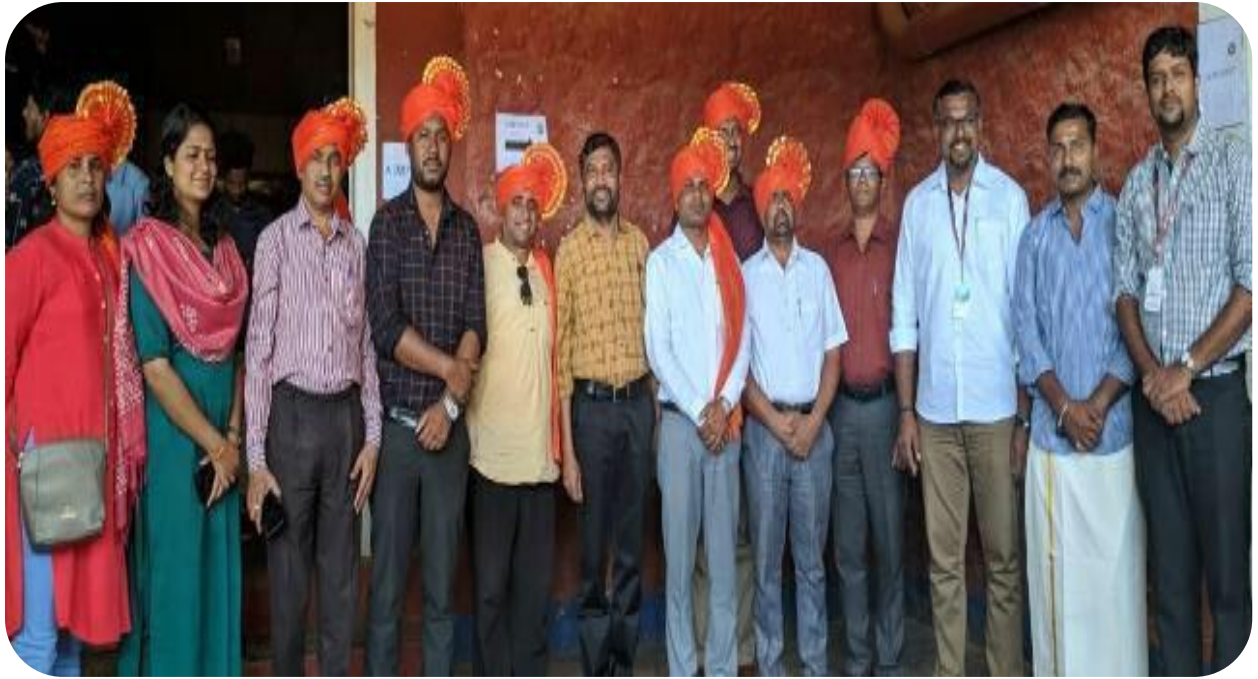
NSS Program Officers from different states