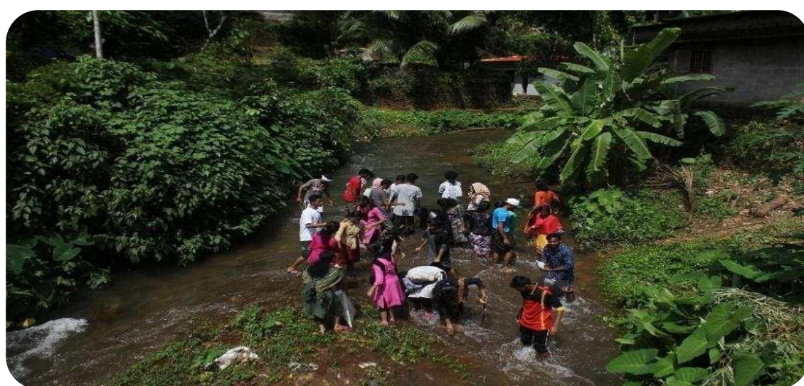
Restoration of the Koruthodu River

Rivers are the lifeline of any society. Marian has even been in the forefront to conserve water and spread the message on the importance of water conservation. Marian students engage in the restoration efforts of the streams and rivers nearby and the National Service Scheme volunteers of the College put in their efforts in cleaning and restoration of the Koruthodu River near Mundakkayam with the support of the local community. They instilled a much needed awareness on the importance of healthy water bodies and their conservation among the nearby inhabitants.