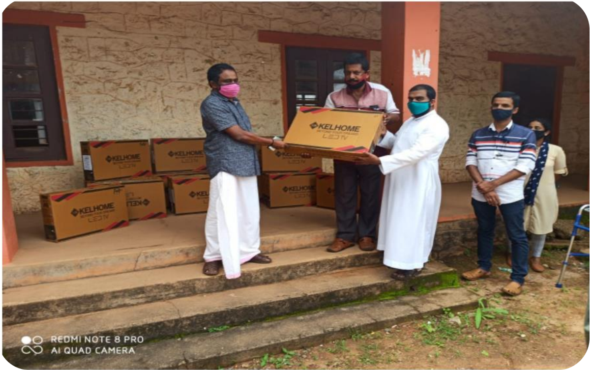
Inauguration of Television Distribution