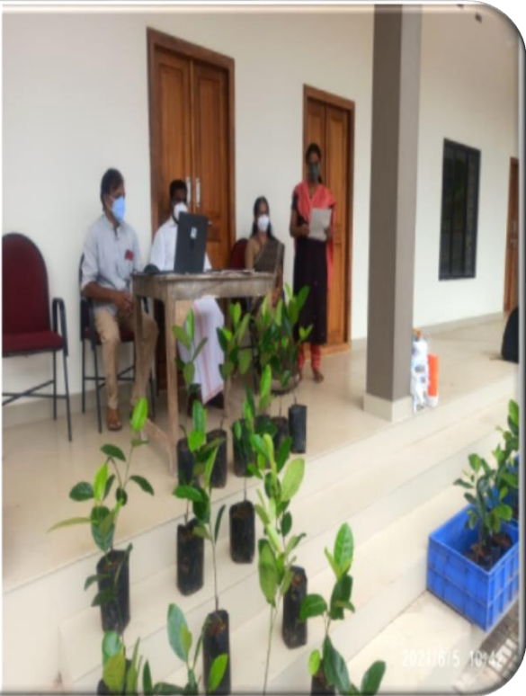
Tree Sapling Distribution Programme