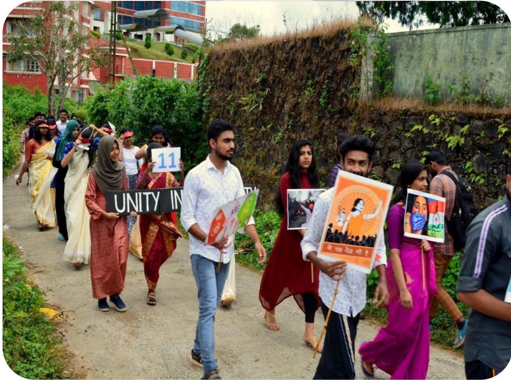
A Cultural roadshow on Ethnic day