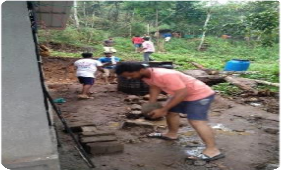
House construction work