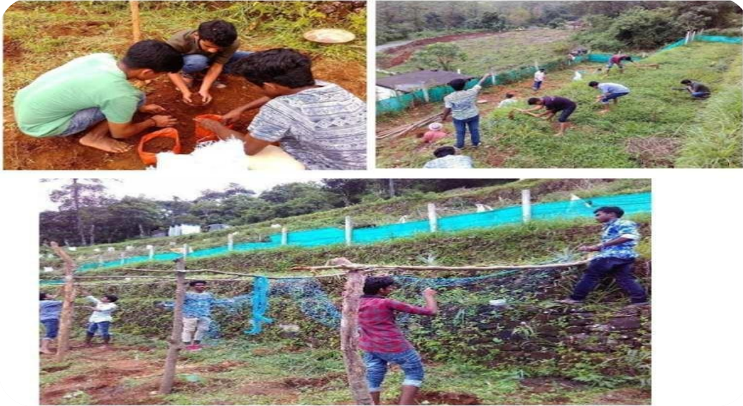
An organic vegetable garden at Govt. Harijan Welfare UP School, Kattadi Kavala.