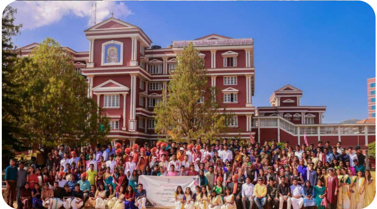
Students from different states arrived for participating in NATIONAL INTEGRATION CAMP 2020