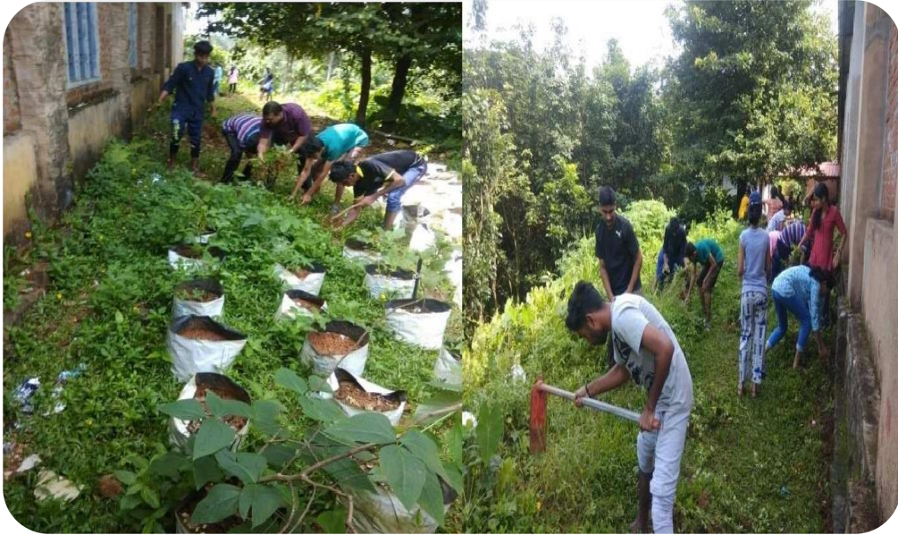
School Cleaning at Koottikkal

The Extension Department of the College together with the NSS unit organized a seven-day camp SUARNAM towards the renovation and revamping of a school in Koottikkal by cleaning the school premise and starting a vegetable garden.