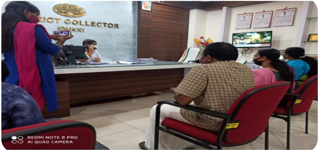
Discussions with District Collector for relief operations