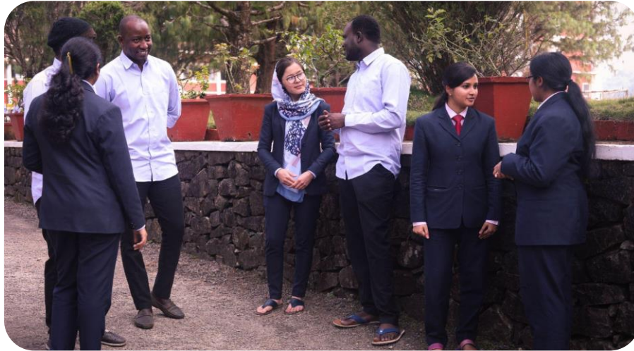
Interaction with foreign students

The students from other countries are encouraged to be an integral part of the Marian academic community, familiarizing them with the rich culture of our country which leads the students to a deeper understanding of the various cultural backgrounds of students from across the seas. They find it an extremely rewarding experience to study in India. They find Marian campus very friendly, warm and welcoming.