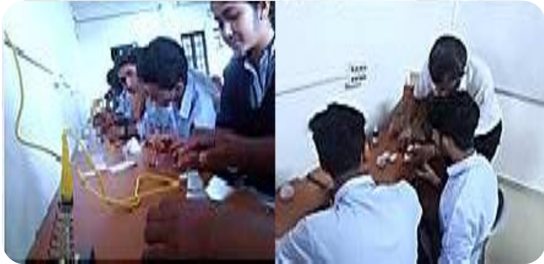
Training for LED bulb assembly

Marian College has signed a MoU with KEL Electricals, Mundakayam for regular supply of LED bulbs and to buy-back the damaged ones. Over and above, training is imparted to the students on LED assembly.