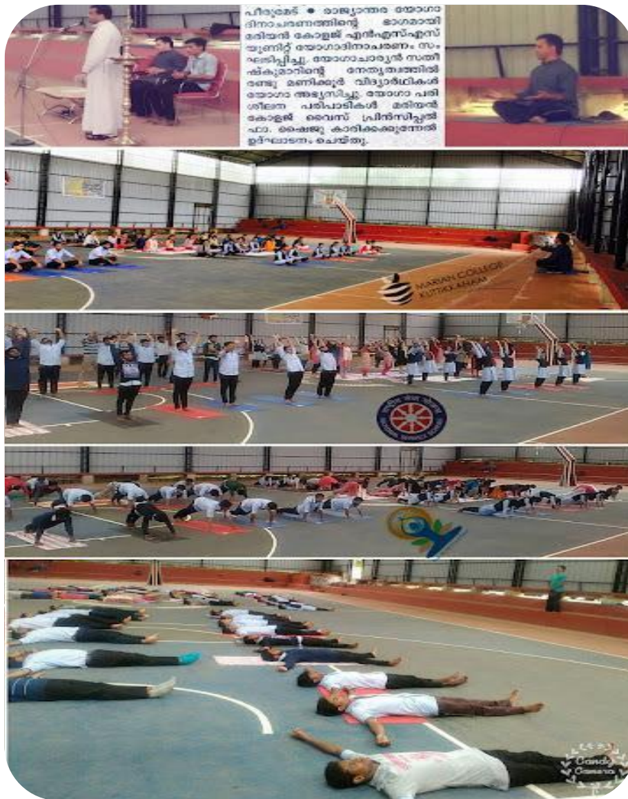
Students practising Yoga on International Yoga Day