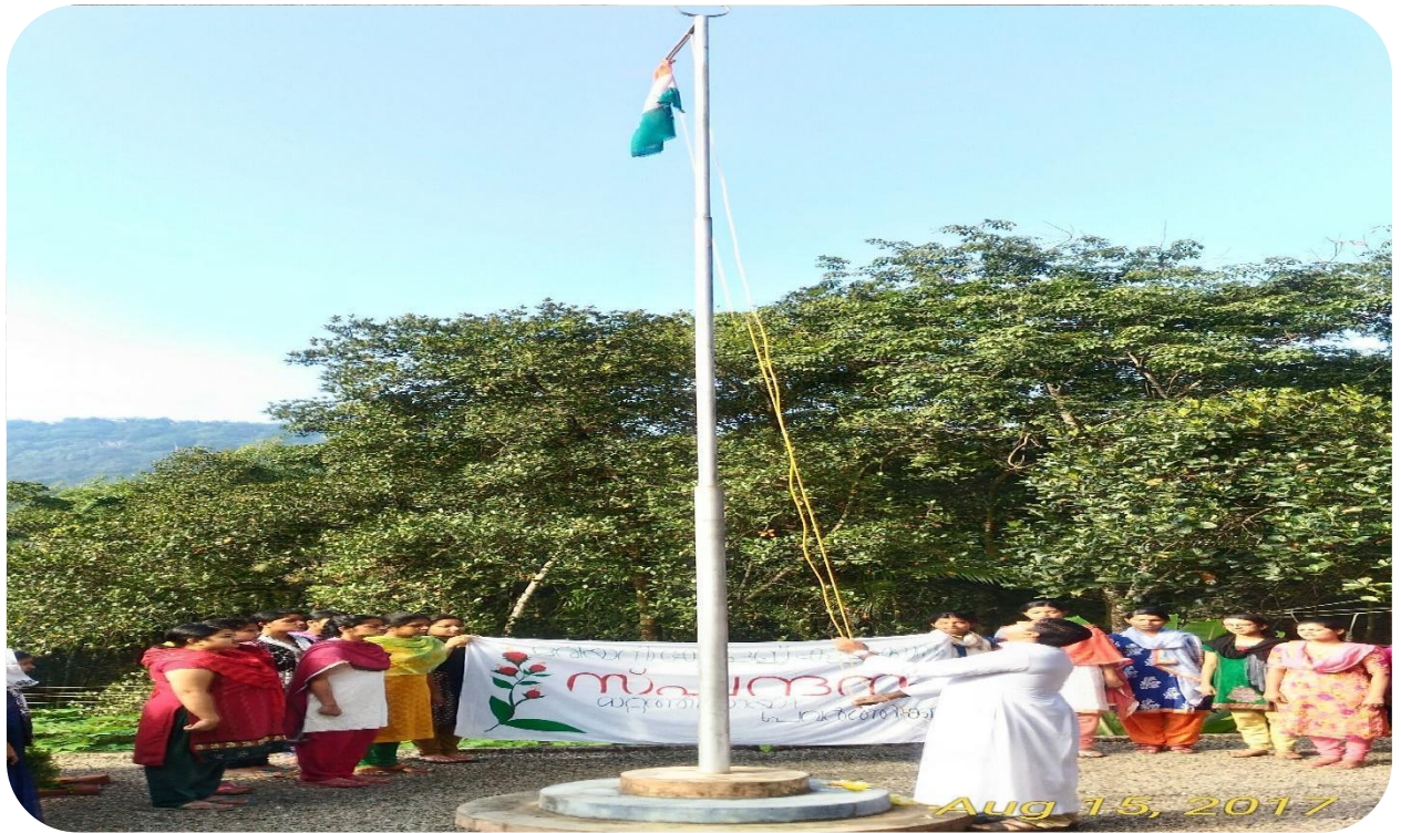
Flag hoisting at the Rural Camp