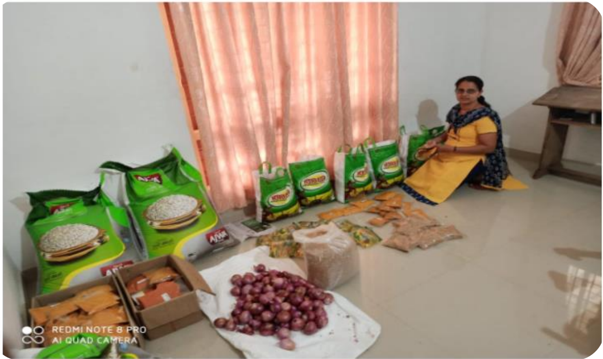
Packing of food kits