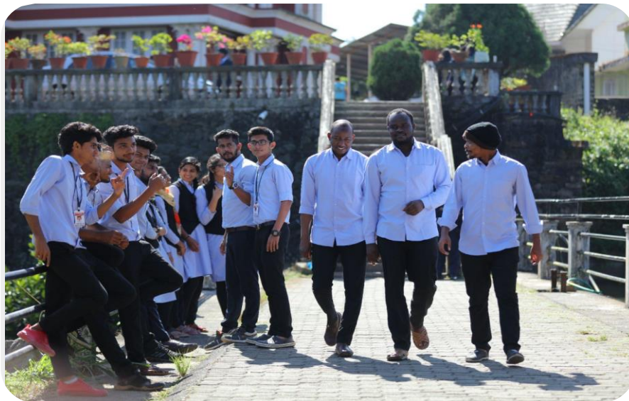
International students on Marian Campus