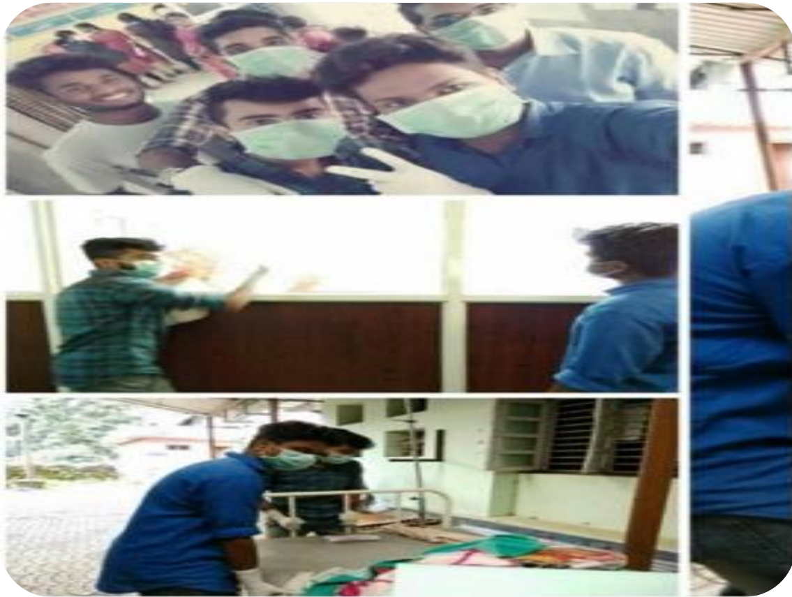
Students Cleaning Government Taluk Hospital, Peerumedu