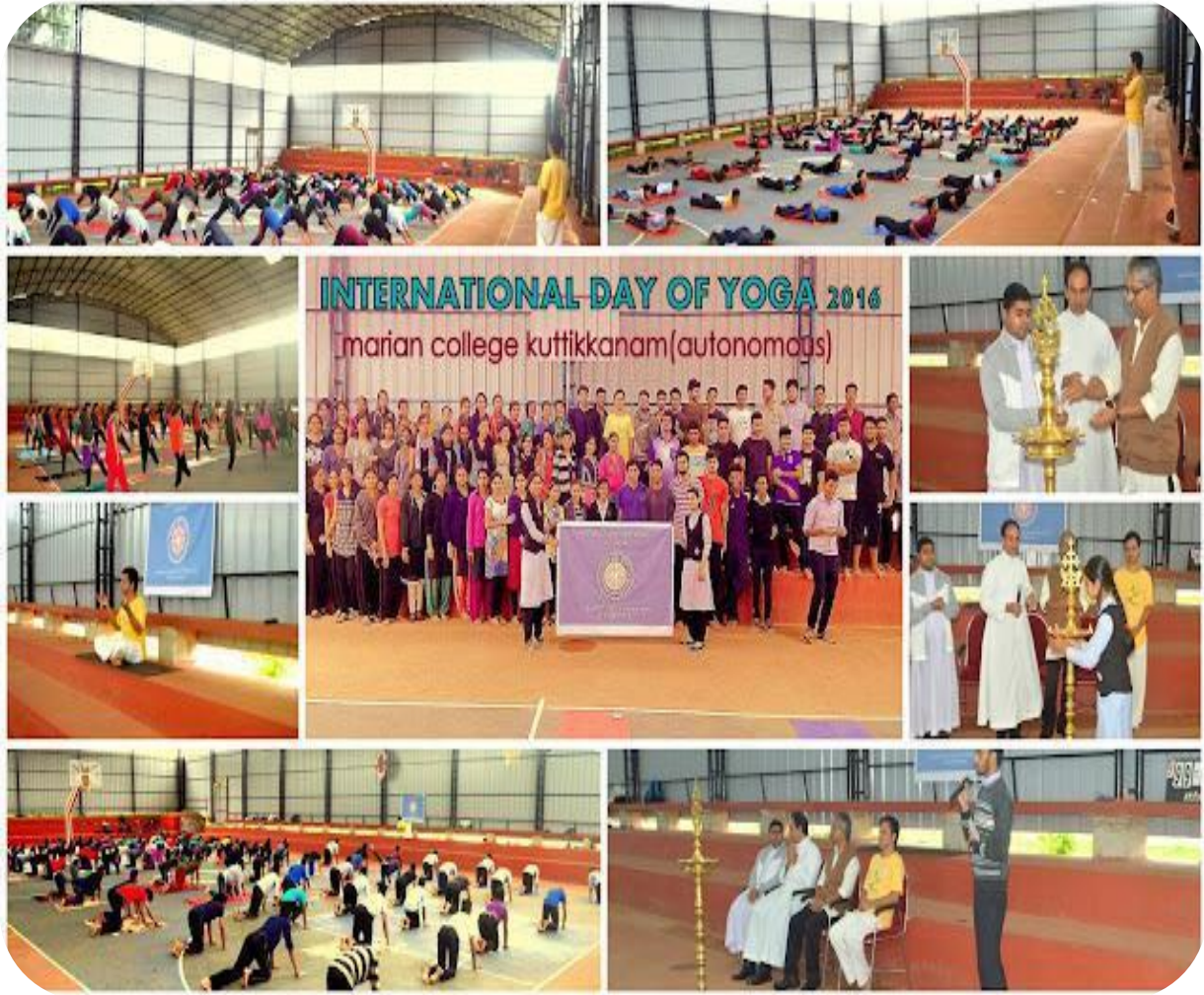
Activities conducted on International Yoga Day