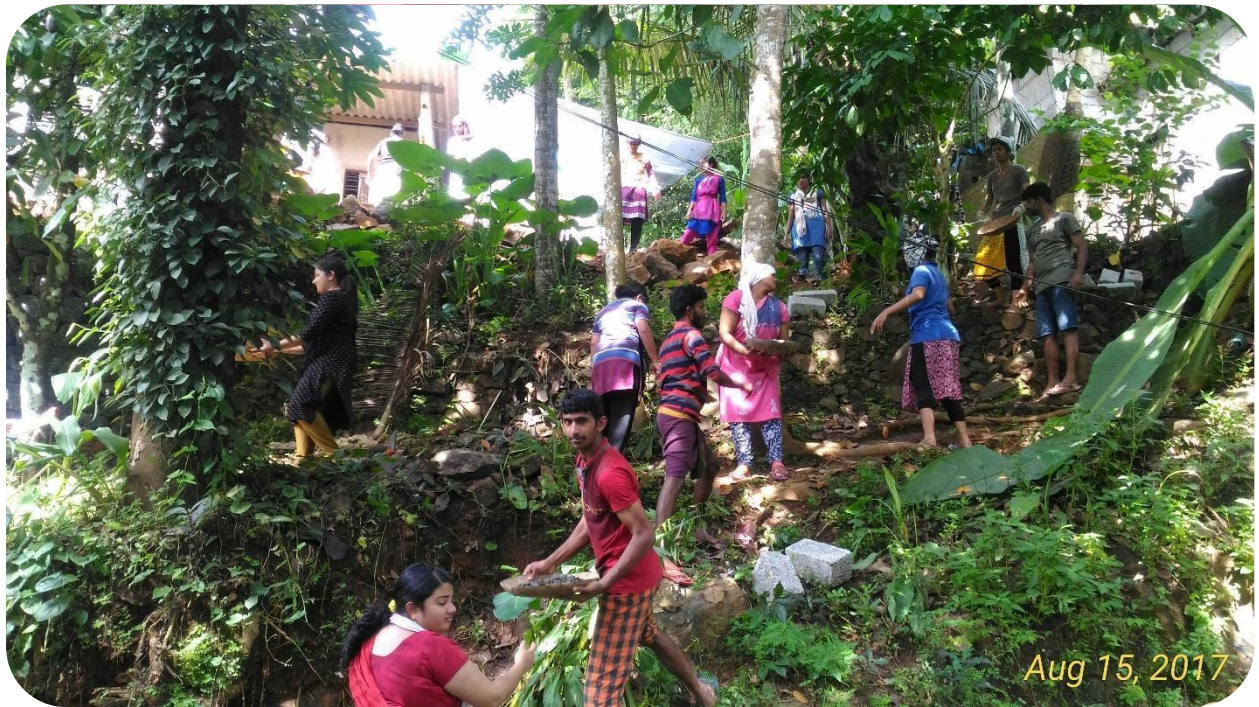
Supporting construction of house for a soldier as part of Independence Day celebration