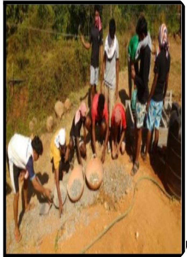
Outreach – House Construction by Marian students at Chenkara