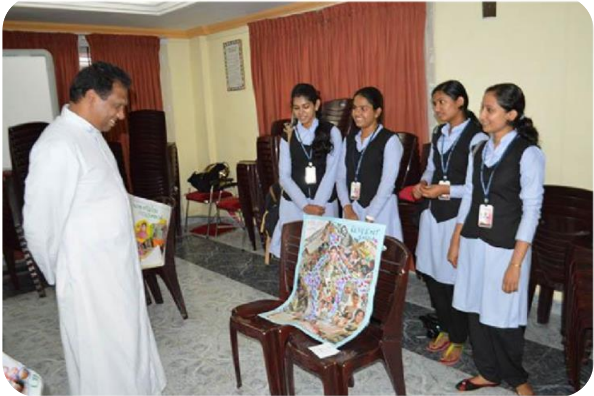
Exhibition during Women's Day - Showcasing the talents of students