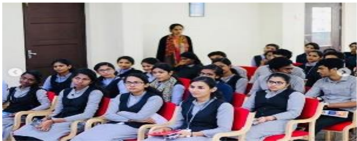
Preparation for Mock UN