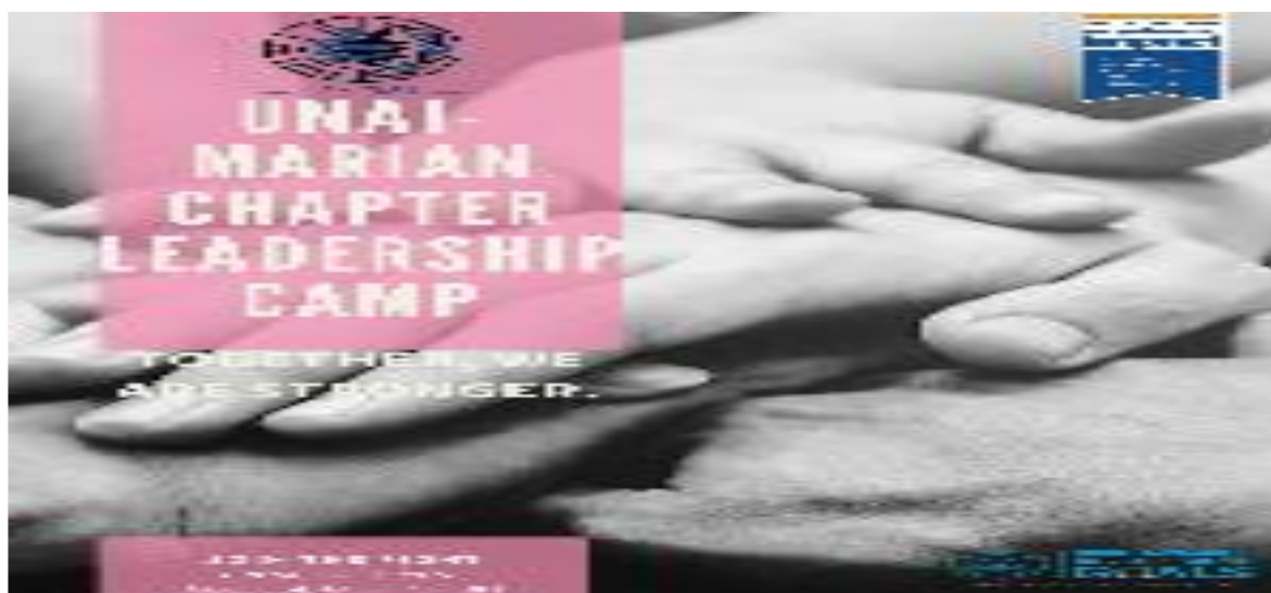
Leadership training program