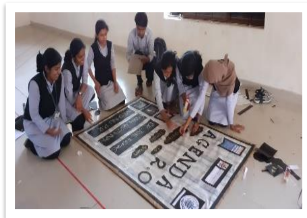
Symposium organised by UNAI Aspire Marian along with the Sustainable Development Research Cell of Marian College Kuttikkanam.